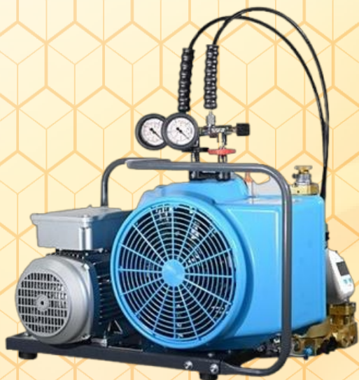
Breathing Air Compressor