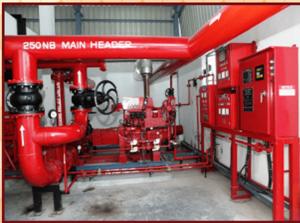
Fire hydrant System Installation & Service