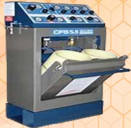
Hydro Pressure Testing of Air Cylinder & Refilling