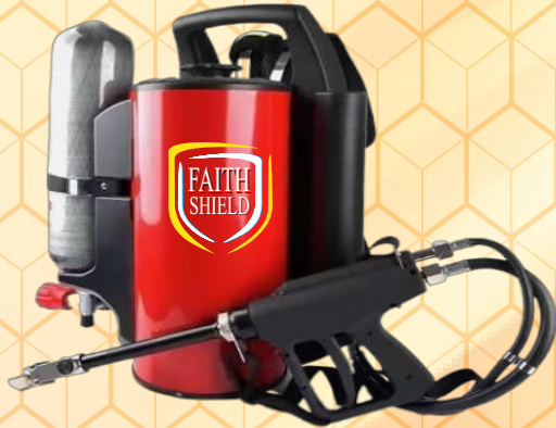
Low Pressure Back Pack Watermist & Caf System (9L/10L)