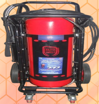
Low Pressure Trolley Mounted Watermist & Caf System (50L)