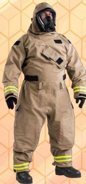
NFPA Fire Suit