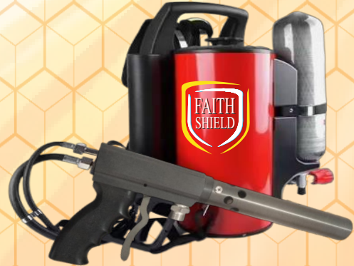
High Pressure Back Pack Watermist & Caf System (9L/10L)