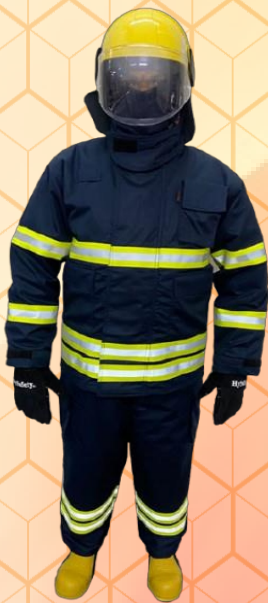
EN Fire Proximity Suit