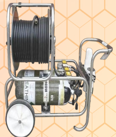
Trolley Airline Breathing Apparatus