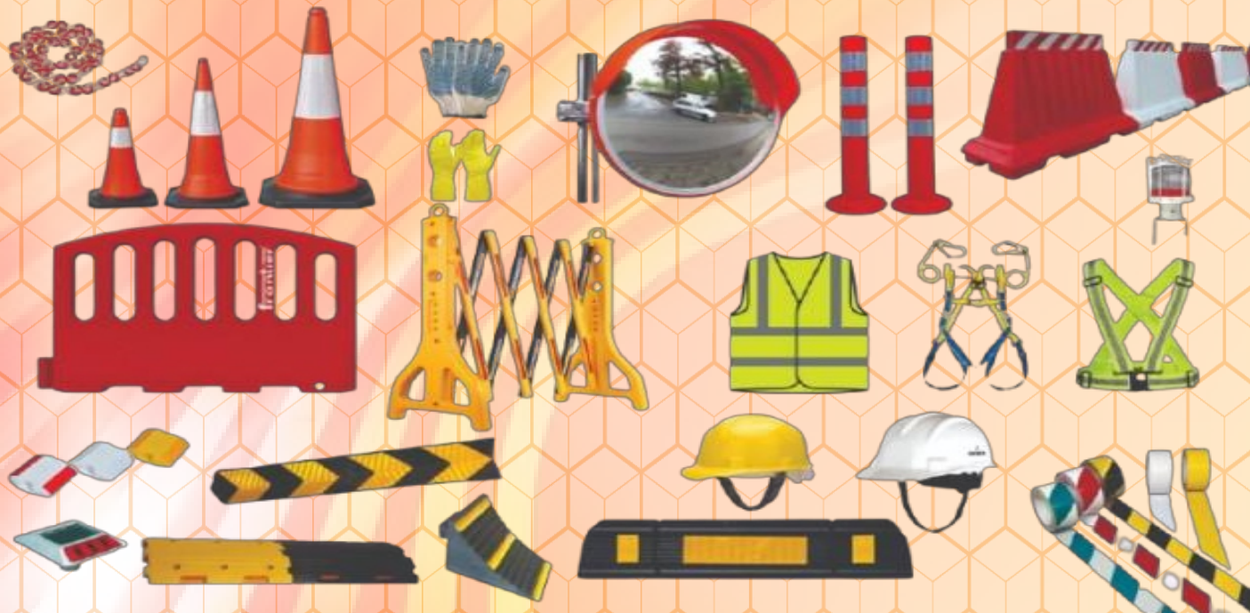
Road Safety Products