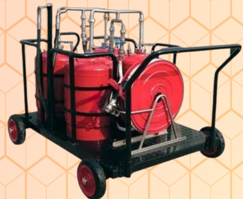
Tetra Quad Extinguishing System (250-400 lts)