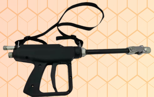
Low Pressure Watermist Gun