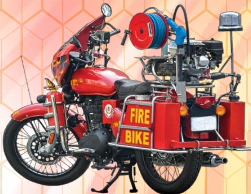
Cutting Edge Rapid Action Firefighting Bike