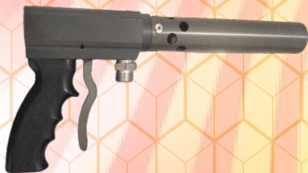
High Pressure Watermist Gun