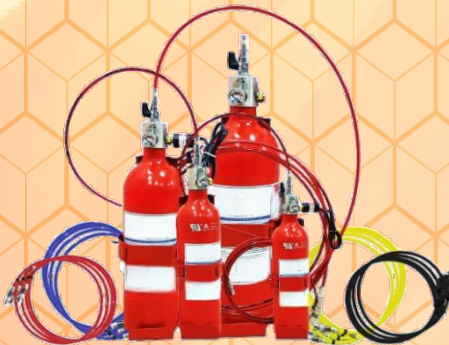
DLP & ILP Fire Suppression System