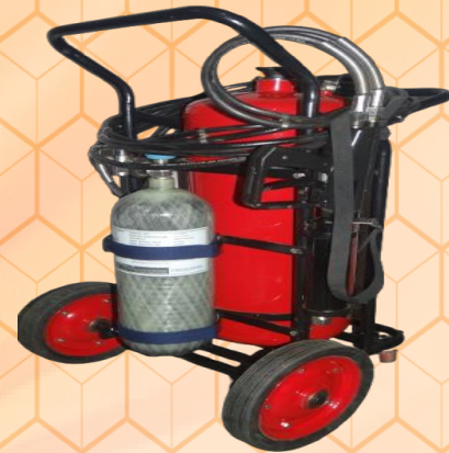
High Pressure Trolley Mounted Watermist & Caf System (50L)