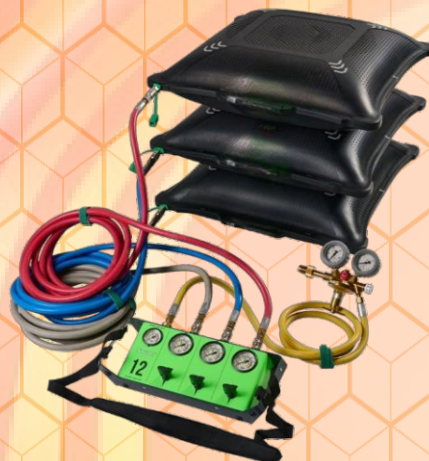
Air Lifting Bag